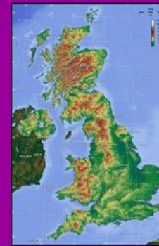
Relief map of the United Kingdom