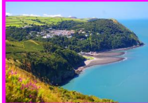
Exmoor National Park