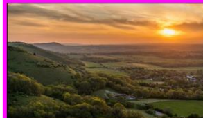
South Downs National Park