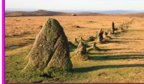
Dartmoor National Park