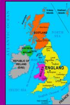
Political map of the United Kingdom