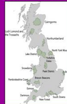
Britain's National Parks