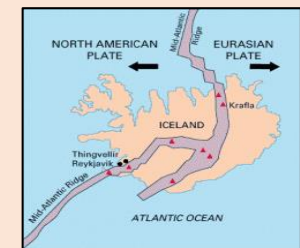
The Mid-Atlantic Ridge