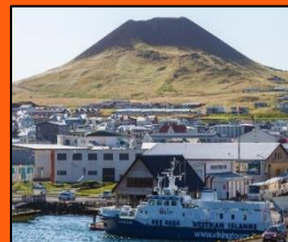
Iceland and the island of Hiemaey