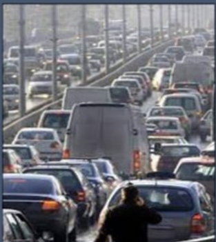
Congestion and pollution