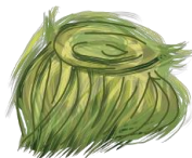
Seaweed B is ?