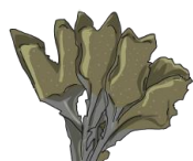
Seaweed A is ?